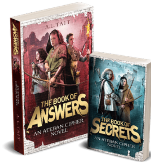
The Ateban Cipher Books