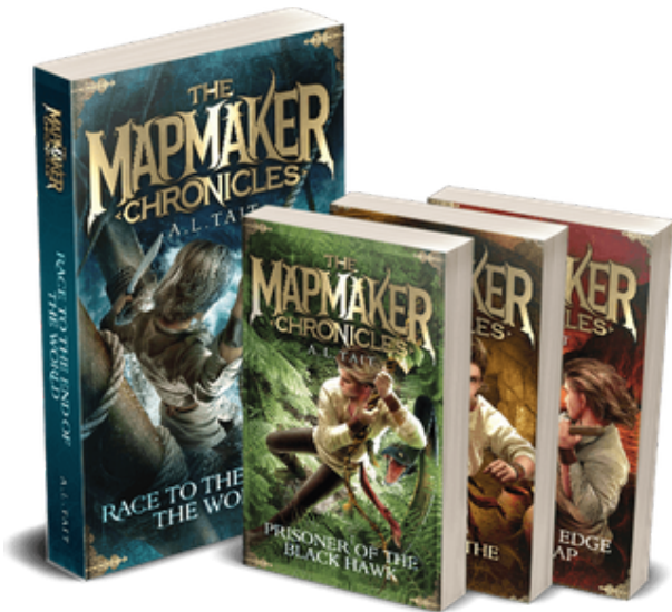
The Mapmaker Chronicles Series